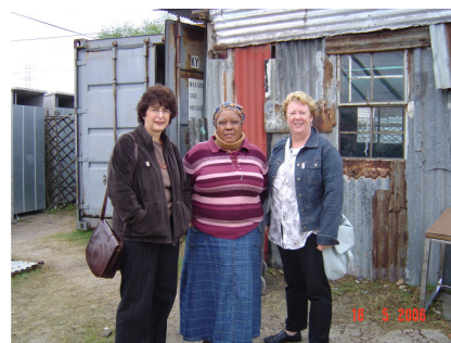
Cape Town Township – Nobubele - Nyanga – a Centre for Early Childhood Development Project